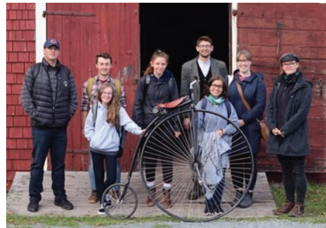
Anth 492: Museum also teamed up with Shebrooke Village and helped with a Re-Organization project!